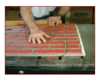
2. Cut the panel at a 45 degree angle. TIP: A simple panel cutting jig helps to do this on a table saw.