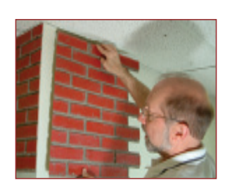
7. Fit the second piece making sure the miter is nice and tight.