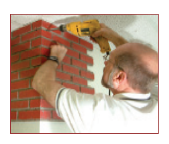
8. Then glue and screw in place.